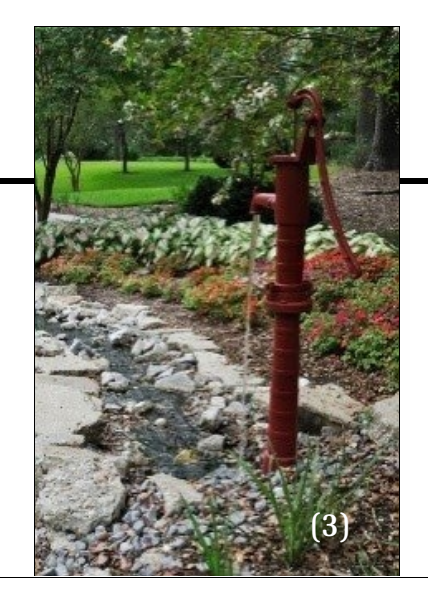
Baton Rouge Public Gardens on Tour Sunday, NOV 6, 1:00 – 5:00 pm

7 ithout a doubt, Baton Rouge has some of the most beautiful public gardens in the state of Louisiana! On Sunday, November 6th from 1-5pm, Hilltop's fall garden tour will feature our place of course the LSU Hilltop Arboretum (1), Cohn Arboretum (2), Botanic Garden at Independence Park (3) and Windrush Gardens (4). Each garden has a unique history, mission, design, plant collections and plans for their future development. This will be the perfect opportunity to see all the gardens in the fall season and learn more about