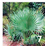
Dwarf Palmetto (8' x 6' Average)