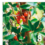
Yaupon Holly 'Scarlet's Peak' (20' x 3' Average)

Native, evergreen shrub with mounding form with stiff, upright leaves in several planes. It thrives in wet, swampy areas but grows very nicely in well-drained garden conditions. Best grown from seed or small containerized plants, very difficult to transplant. Great substitute for exotic split-leaf philodendron.