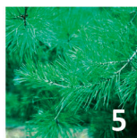
Spruce Pine (25' x 20' Average)

Native, evergreen tree with upright, oval form with slow rate of growth. It grows in swampy, acid soils, in association with sweet bay and cypress trees. The white flowers are magnolia-like, a five-lobed fleshy cup with many yellow stamens. A close relative to Franklinia alataamaha (Franklinia), discovered by John Bartram in Georgia.