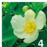
Gordonia (30' x 20' Average)