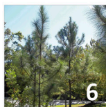
Longleaf Pine (60' x 30' Average)

Native, evergreen tree, open, irregular form that resembles the canopy of an oak tree. The pine needles are twisted (2.5-3 inches long), and the small pine cones (2-3 inches long) are arranged in clusters of 2 to 3. The tree tolerates moist soil conditions better than most other pines. Fast growth rate in the first five years.