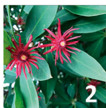
Starbush (8' x 6' Average)

Native, evergreen tree that thrives in a loose, moist, fertile, and acid soil in full sunlight to partial shade. The 'Emory Smith' magnolia, a cultivar of the Southern Magnolia, is registered with the International Magnolia Society and named in honor of Hilltop's donor Emory Smith.