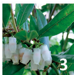
Florida Leucothoe (12' x 12' Average)

Native, evergreen shrub with upright oval to irregular form. It grows best in filtered sunlight under the canopy of high soaring shade trees. The shrub tolerates moist, slightly acidic soils, but performs best in sandy, well-drained soils. Dark maroon-red, star-shaped nodding flowers (1.5 inches wide) are a show stopper in early spring.