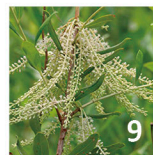
Titi (10 x 8' Average)

Nativar (cultivar of a native species), evergreen tree with a very narrow upright growth habit. The tree makes a great vertical landscape or accent plant. It produces volumes of bright red berries that persist through the winter and attract birds. Does best in evenly moist, acidic soil, and is drought tolerant.